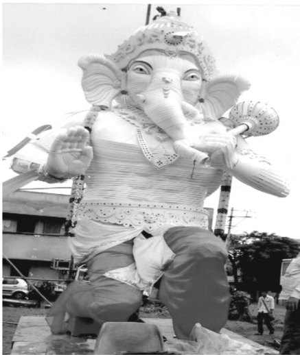
Fig 1: Ganapathi Idol