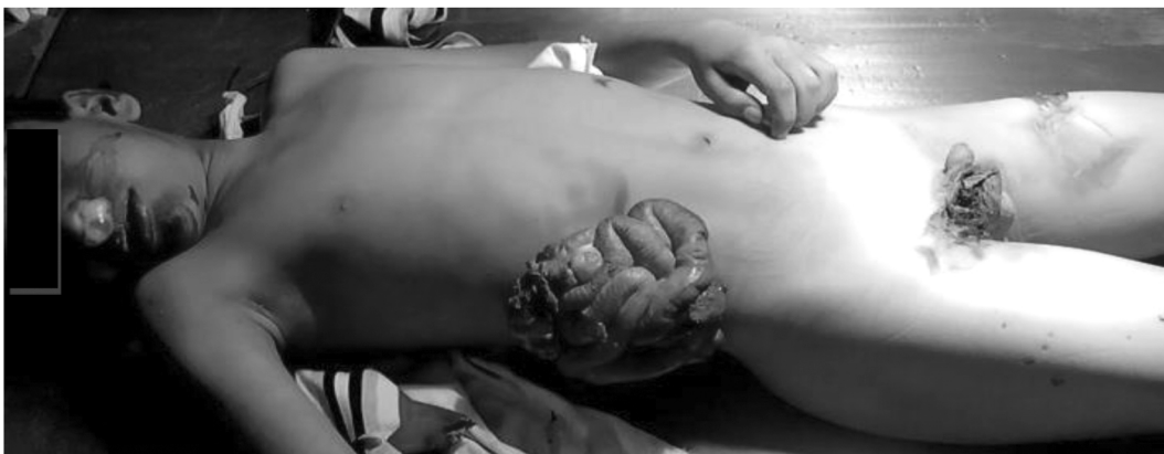
Figure 4: Cavity deep crater over the Right Flank through which the intestines (thickened & hardened-Margins blackish with peeling of skin) protruding out