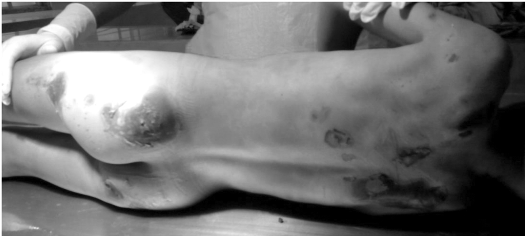
Figure 3: Diffuse multiple burn injuries over the back, hips, & back of lower limbs